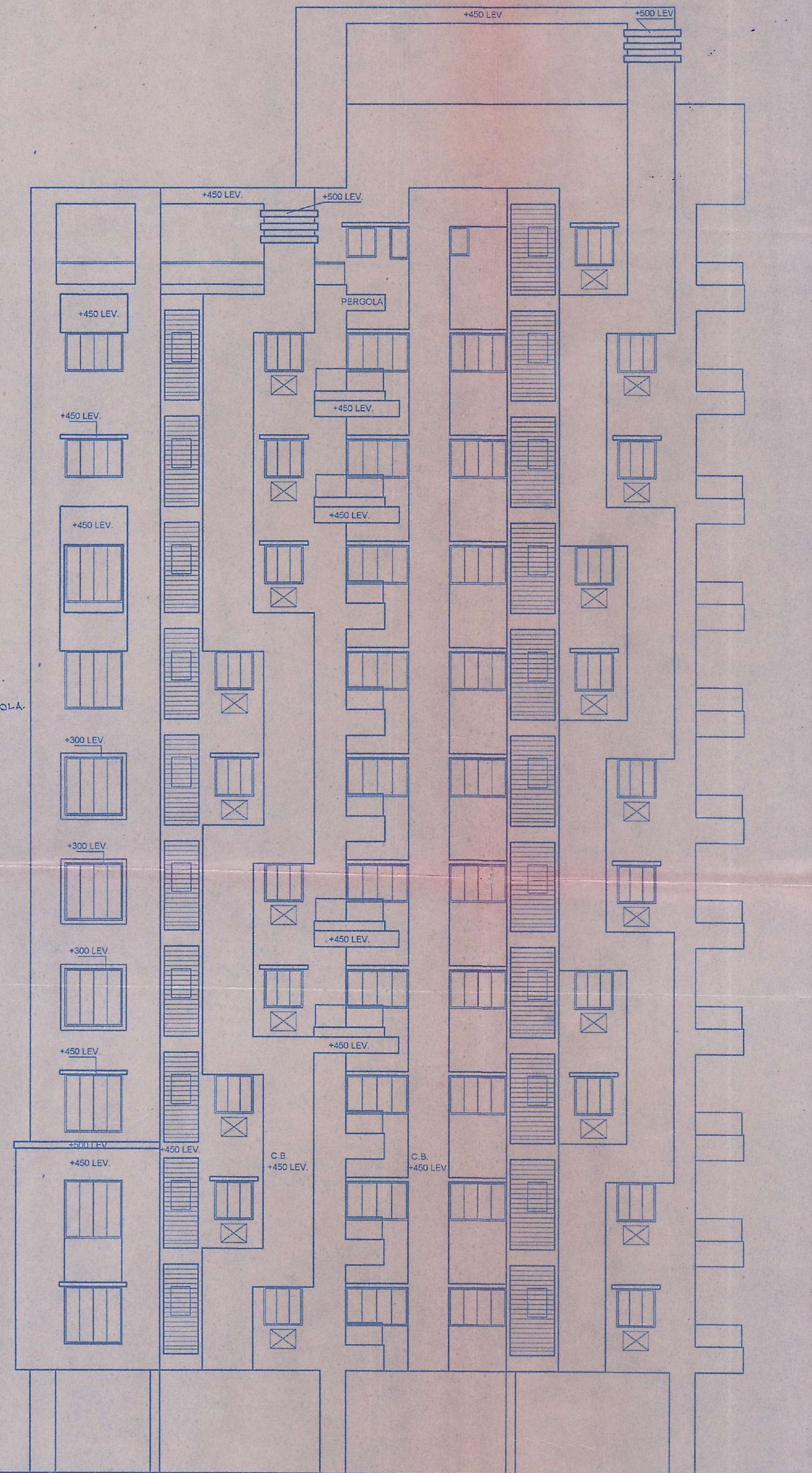
WEST SIDE ELEVATION.

CERTIFICATE OF STRUCTURAL ENGINEER THIS IS TO CERTIFY THAT THE STRUCTURAL DESIGN AND DRAWINGS OF BOTH FOUNDATION AND SUPER STRUCTURE OF THE BUILDING HAS BEEN MADE BY ME CONSIDERING ALL POSSIBLE LOADS INCLUDING THE SEISMIC LOAD AS PER THE NATIONAL BUILDING CODE OF INDIA AND CERTIFY THAT IT IS SAFE AND STABLE IN ALL RESPECTS. K. SENGUPTA KOUSHIK SENGUPTA B.E. (CIVIL), M.E. (STRUCTURE) E.S.E.-1/76 (K.M.C.) SIGNATURE OF E.S.E.